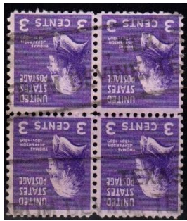
4.4544 TEXAS / FROM DEVINE, TEXAS