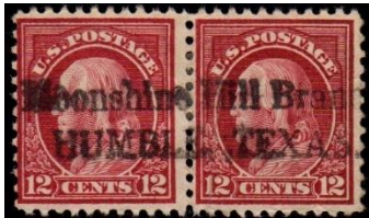
3.6153 2L HS Branch