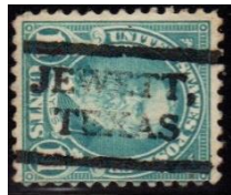
0.4153 bar A&B