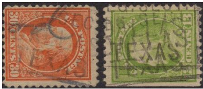
3.75(44/45/45) REG. SECT. / DALLAS / TEXAS