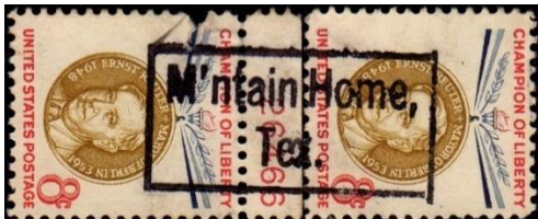
2.56 abbrev M'ntain