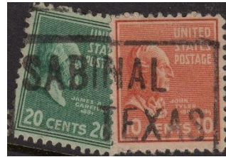
2.4546 T/S offset