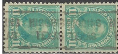
0.4543 SS HS with bar A&B, aligned like SLR 7.4543